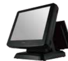
with 2 nd Display LCD

The KS-7415G Series supports versatile peripheral options such as MSR, customer pole display, programmable keypad, and a wide range of connectivity to meet numerous applications.