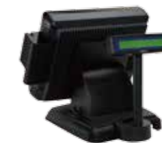
with Customer Pole Display