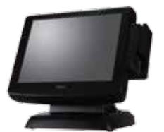
with MSR and Fingerprint Sensor