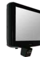
with Barcode Scanner