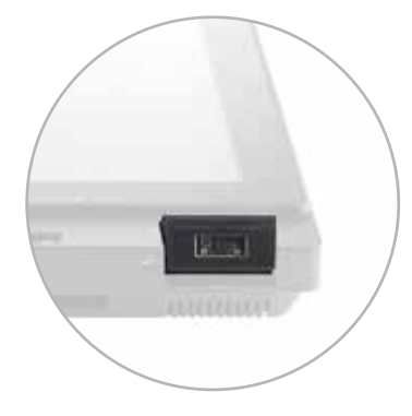
Optional Built-in 2D Barcode Scanner