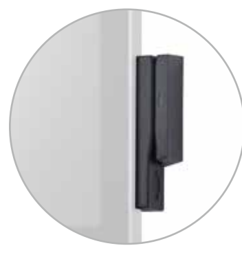
Optional 3 in 1 Module of MSR, RFID and Fingerprint Reader