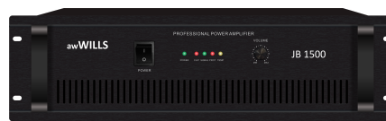
Power amp JB1500