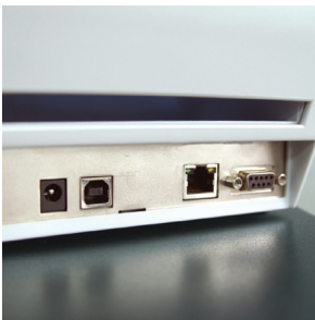
Ethernet, Serial and USB ports included

The DT2 and DT4 are perfect for retail barcodes and shipping labels.