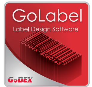
Free labeling software GoLabel for easy printing