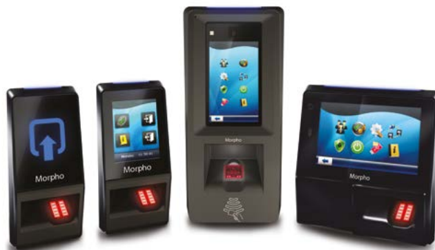
THE SIGMA FAMILY