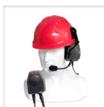
CHP750HS ■ CHP950HS ▲ Hard hat eardefender, submersible PTT

○ Submersible products are represented with a water droplet.