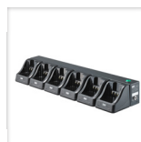
CSBHT ■ Six-way charger

Supplied package includes: 2000mAh Li-Ion battery pack, charger, spring loaded belt clip, high efficiency antenna & quick start user guide (ATEX models are supplied with an 1800mAh 7.4v Li-Ion Battery)